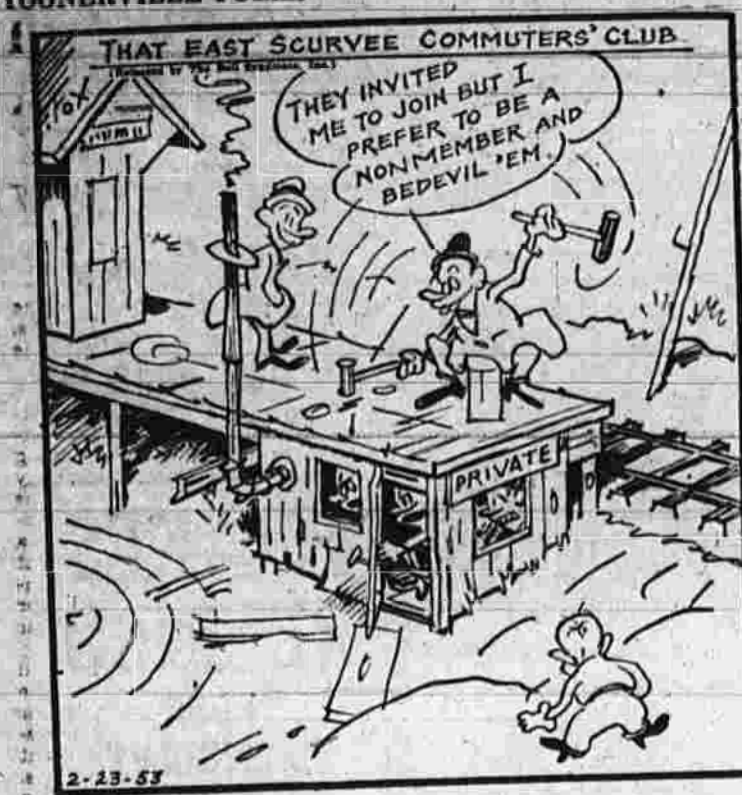
"They invited me to join but I prefer to be a non-member and a benevolent member."