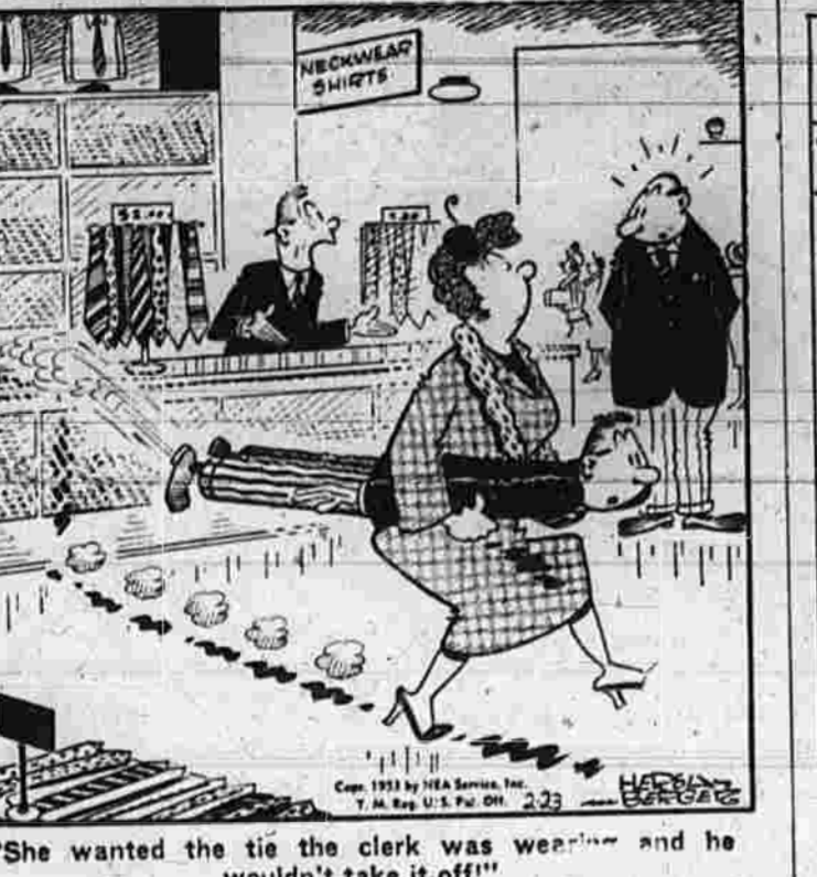
"She wanted the tid the clerk was wearing and he wouldn't take it off!"