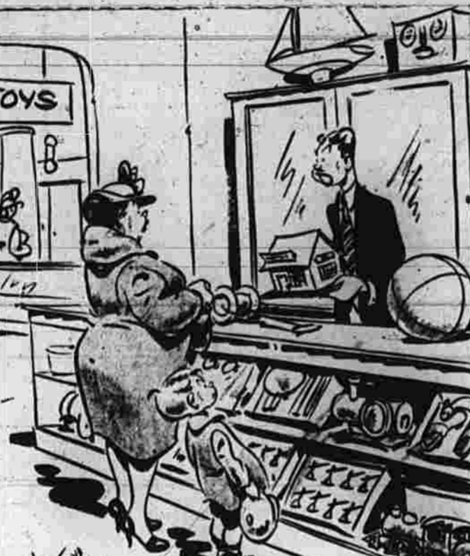
"But this is an educational toy, madam! It's so well built he'll really have to figure a way to take it apart!"